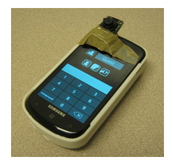
Figure 3. The prototype used to test the authentication methods.

During the interviews, we first asked participants about how they would like to control access to their most important phone applications. Next, they tried multiple authentication methods including biometric authentication and then gave feedback on two mechanisms for limiting access while sharing: activity lock and group accounts. The study first focused on their phones, and then we repeated the same questions for their tablets. We now describe each section of the interview in more detail.