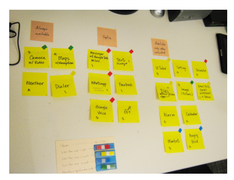
Figure 1. Participants categorized their applications by whether they wanted the application always available , available only after unlocking , or if the application's functionality should be split between those two categories.