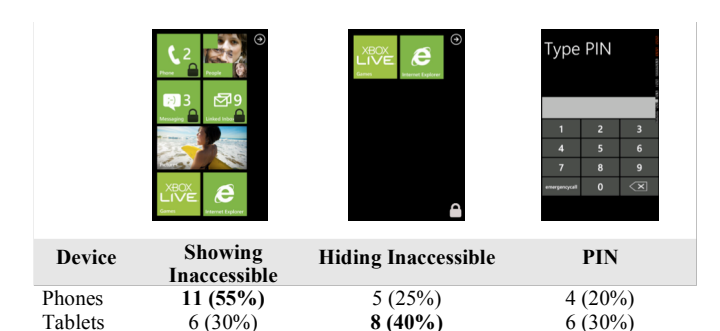
Table 5. Participants' preferences among designs for navigating a locked device. Most preferred method for each device is bolded.