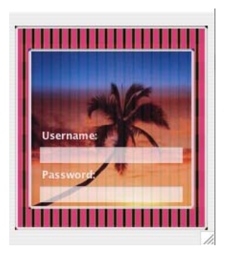
Figure 3: The trusted password window displays the visual hash that matches the website window borders.