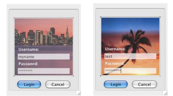
Figure 1: The trusted password window uses a background image to prevent spoofing of the window and textboxes.

Our approach is based on window customization [16]. If user interface elements are customized in a way that is recognizable to the user but very difficult to predict by others, attackers can not mimic those aspects that are unknown to them.